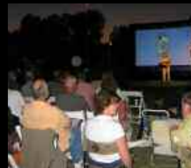
Guest speakers discuss the making of the film.