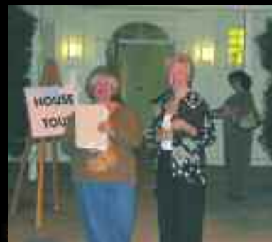
CHP volunteers lead tours of the site.