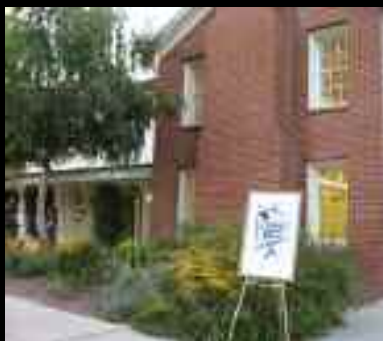
The house at Shadow Ranch Park.